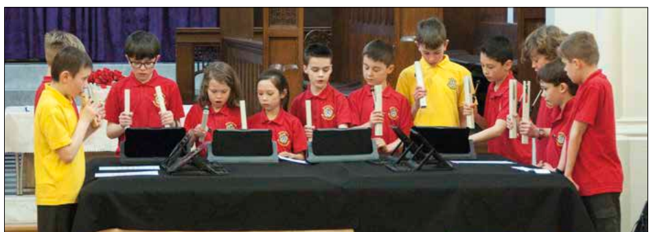
The tune ringers: "She'll be comin' round the Mountain" complete with a train whistle