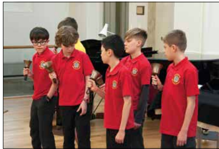
Plain Bob Doubles, on the mat