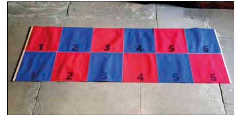
The mat used for change ringing performances

The other class (Small Ensemble) is limited to ten players and this was where we ring changes. We do this a bit like handbell